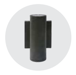
CWSW Cylinder Wall Sconce