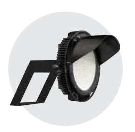
SIGNAL Flood Light & High Bay