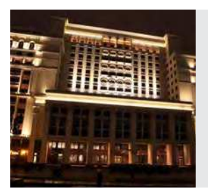
BOX : FLOOD LIGHT

BOX is an ideal flood light for square configurations in outdoor wet rated applications, directly replacing traditional technologies.