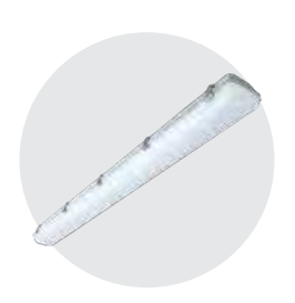
VTS Vapor Tight Surface