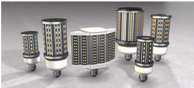
HID REPLACEMENT LAMPS

EiKO makes choosing a quality replacement lamp easy.