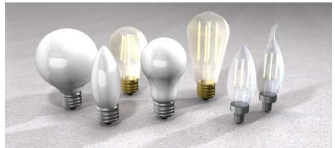
GENERAL PURPOSE LAMPS