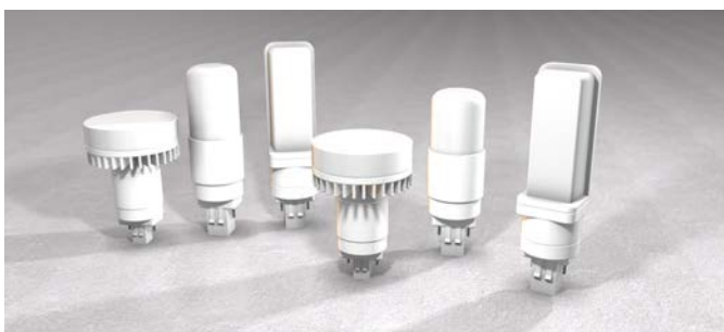
PIN BASE LAMPS