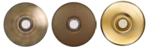
Antique Brass Architectural Bronze Polished Brass