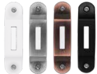
White Nickel Copper Black